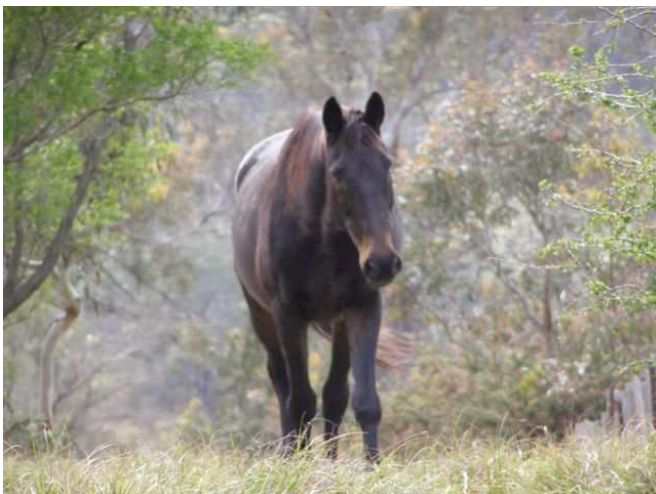
The "old fella" Chester