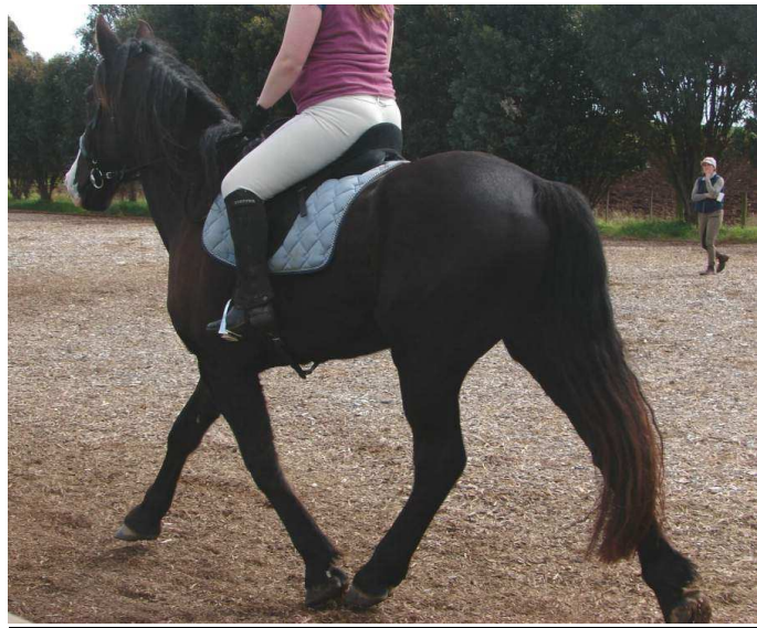
TADS participant and instructor