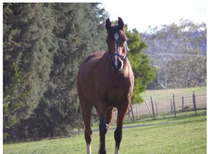
Performance Park Riverdance aka 'Abby'