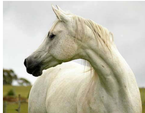
Desert Fox Topaz ( Simeon Solomon x Spanish Fantasia ).

Both Desert Fox Topaz and Dowling Nefertari will be making a little visit to Valley Springs Arabians in September to visit the lovely Valley Springs Tamaan .