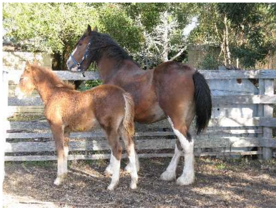
Clydesdale mare Lucy with chestnut 4 mth old arab x filly

Please contact Yvonne Masters 63834279 or 0409251272 POA