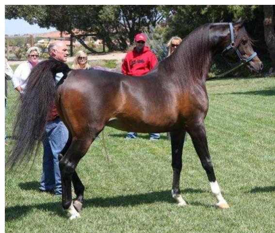
Mazkerade (full brother)