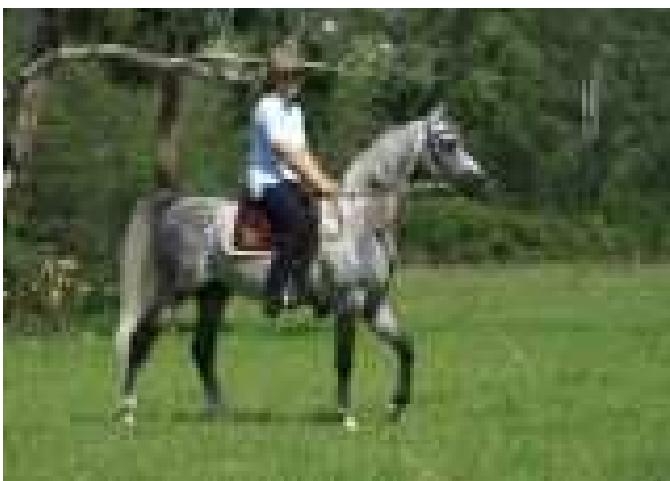
Maraj El Dakar

A son of U.S. National Champion Stallion and World Cup Champion Stallion, “ Dakar El Jamaal ”, from the exquisite Ali Jamaal daughter, “ Majalis ”.